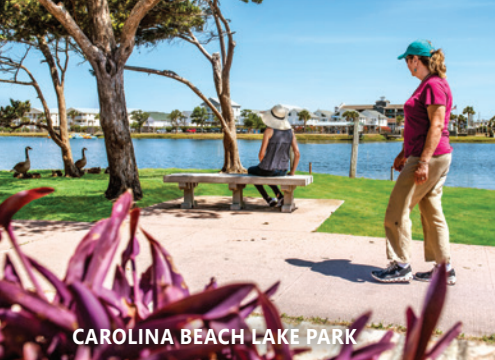
CAROLINA BEACH LAKE PARK