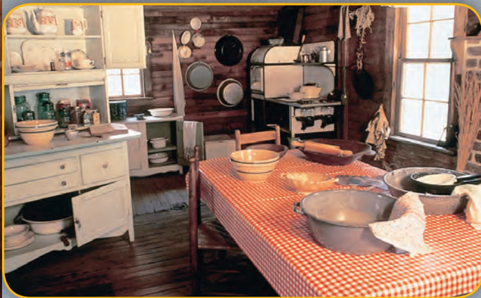
The farmstead kitchen is restored and furnished to resemble its early 20th century décor.

The Iredell Brown Farmstead provides an example of the traditional living arrangements and lifestyle of a typical North Carolina farm family between 1880 and 1940. By visiting this restored homestead, you can experience some of the economic and physical challenges that this depression-era family of seven faced daily. The farmstead consists of a detached kitchen, a four-room house, meat house, milk shed and well.