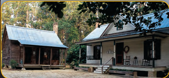
The Iredell Brown Farmstead captures the essence of eastern North Carolina's former farm life.

In addition to the homestead, you can also view other traditional buildings found on or near small farms such as the tobacco curing barn, pack house, workshop and one-room school house.