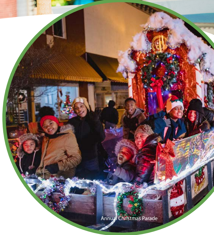
Annual Christmas Parade

It's a season full of fun and holiday festivities for the whole family. We can't wait to celebrate with you, so mark your calendar and let us show you Christmas in Elizabeth City.