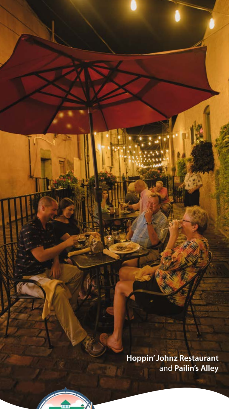
Hoppin' Johnz Restaurant and Pailin's Alley