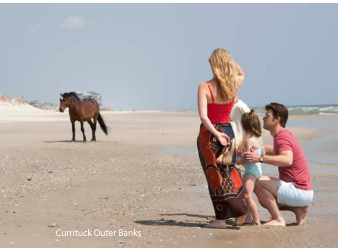
Currituck Outer Banks

Take a day trip to the Currituck Outer Banks and see the wild Corolla Spanish Mustangs! These majestic horses roam freely on the off-road areas of Corolla and Carova and are a distinct breed to NC's barrier islands.