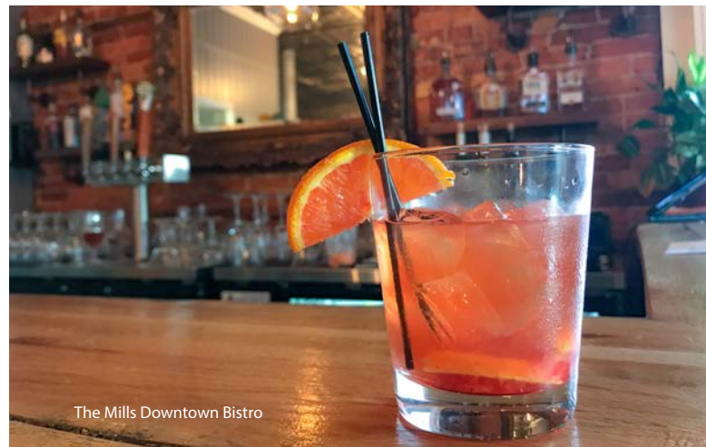
The Mills Downtown Bistro

If a restaurant with creative cuisine and a "back in the good ole' days" vibe is more your style, The Mills Downtown Bistro is the place to go. Everything on the menu is delicious, and they have different specials every weekend so you can always try something new.