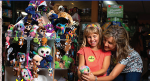
Gift Shops at Mystery Hill