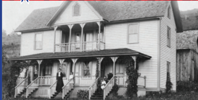
7 1903 Dougherty House Museum