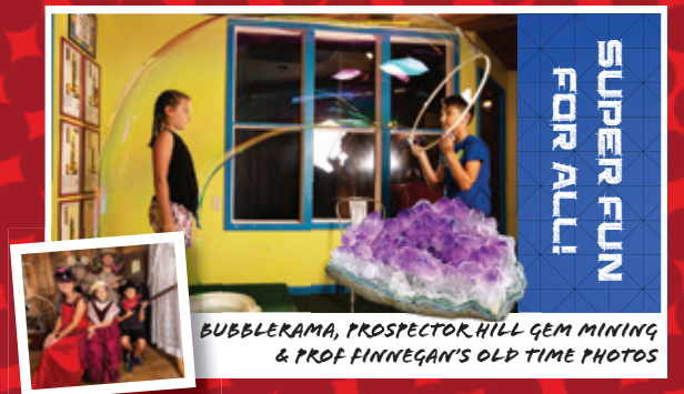
SUPER FUN FOR ALL!