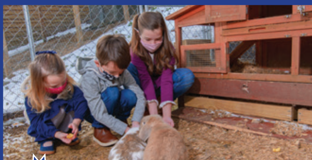
9 Historic Farmyard