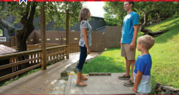
1 Old Cider Mill Platform