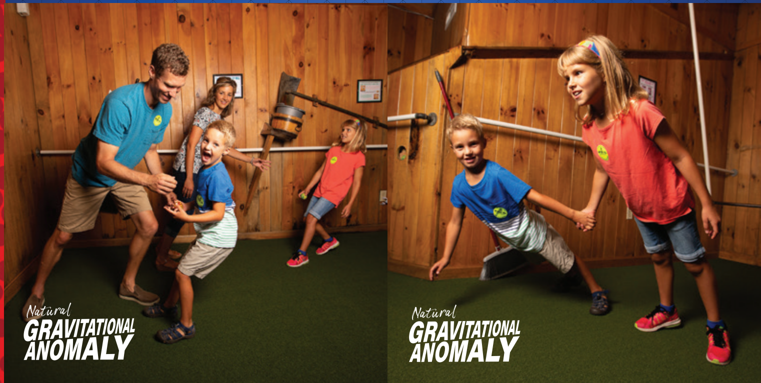
Natural GRAVITATIONAL ANOMALY