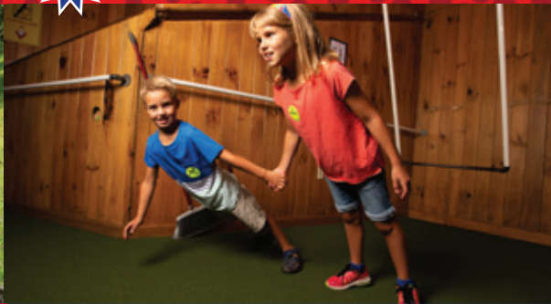
2 Natural Gravitational Anomaly