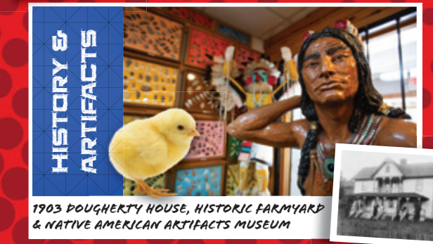
HISTORY & ARTIFACTS