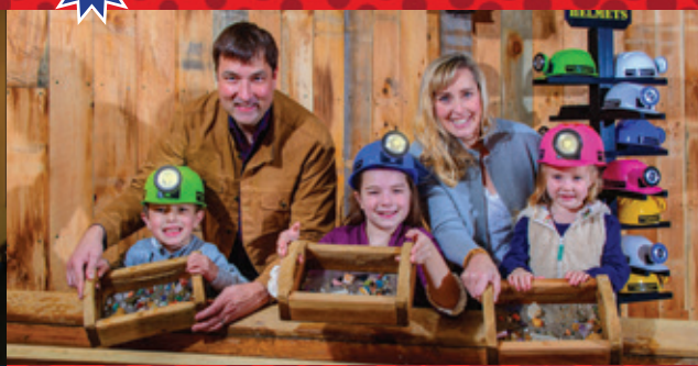
5 Prospector Hill Gem Mining