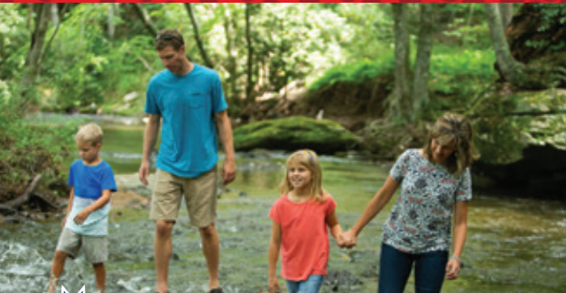
10 River Walk & Tunnel